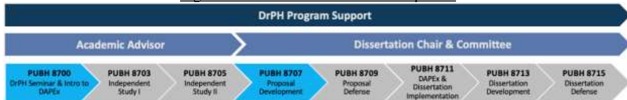
Figure 1.1 Dissertation Portfolio Sequence

The sequencing of the Dissertation Portfolio courses is also outlined in Program of Study . The program of Study shows the integration of the dissertation portfolio courses throughout the entire program. The Program of Study Sequencing Guide outlines how full time and part time students should plan for their coursework and also depicts the optimal timeline in which students take both core and dissertation portfolio courses. The full-time and part-time sequences listed in Program of Study Sequencing Guide are suggested schedules and are subject to change based on course availability and individualized pacing for students.